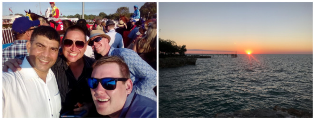
Horse trading – it was super to see some of the sharpest minds in our B-Grade and D-Grade ranks combining some Darwin Cup frivolity with a pre-finals cricketing think tank as the sun sets on the regular season.

Whilst the Premier Grade's gosling is now cooked, in a promising yet agonizing season filled with 'what if's', after a few one-wicket losses, near misses and dropped catches. If their 'sliding doors' season had gone even slightly differently, they could have easily been preparing for finals now. The UnderGrowl is supremely confident that improved attitudes at training, a well understood commonality of purpose and perhaps a deal of catching practice can see this squad achieve great things in 2018.